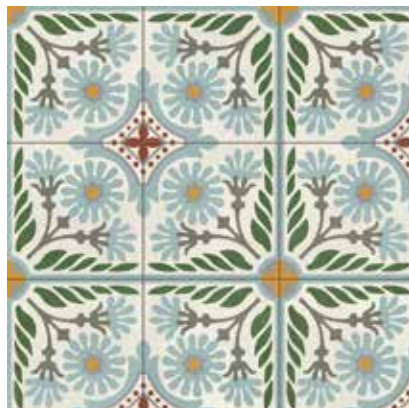
Altea Olivo Natural 59,2x59,2 cm - 23,3"x23,3"