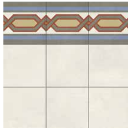
Altea Puerto Frieze Natural 59,2x59,2 cm - 23,3"x23,3"