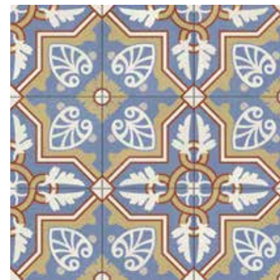
Altea Pinar Natural 59,2x59,2 cm - 23,3"x23,3"