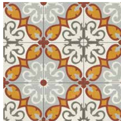
Altea Eida Natural 59,2x59,2 cm - 23,3"x23,3"