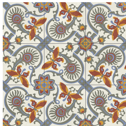
Altea Alba Natural 59,2x59,2 cm - 23,3"x23,3"