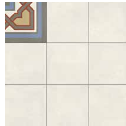
Altea Puerto Corner Natural 59,2x59,2 cm - 23,3"x23,3"