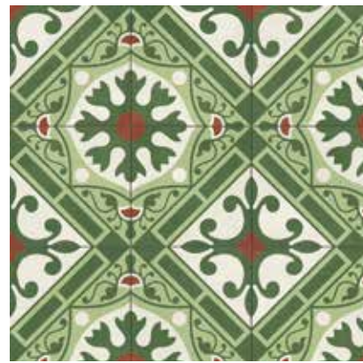
Altea Corbeta Natural 59,2x59,2 cm - 23,3"x23,3"